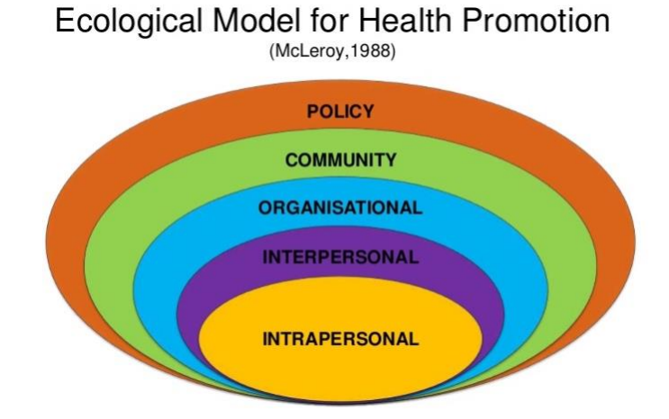
Figure 2: The Socio-Ecological Framework adapted from McLeroy et al. (1988)

The socio-ecological model (SEM) assumes that individual decisions and behaviours are determined by reciprocal interactions within and between the social and physical environment of individuals and are interdependent in nature. This reciprocal causality means that, at the individual level, meaning and behaviour is developed in micro-systems in connection with others and with larger macro-systems, through shared ideals, symbols, language and experiences (Henderson & Baffour, 2015). At the same time, individuals also contribute to their social ecology in terms of constructing norms, beliefs and culture across multiple macro-systems (Henderson & Baffour, 2015). Consequently, micro systems feed into macro systems and vice-versa. As such, the SEM states that individual-level behaviour is shaped by multiple environmental factors and vice-versa, as illustrated in Figure 2 .